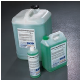
Antiskid Daily Maintenance - a powerful biodegradable multi-purpose surface cleaner