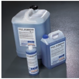
Antiskid Build-Up Remover - a strong sanitising degreaser for all surfaces including kitchens