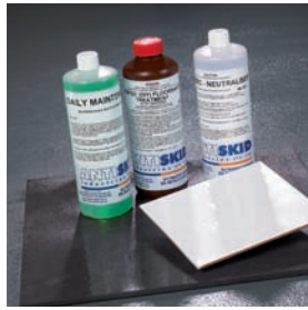
Antiskid DIY Kit - slip resistant floor treatment for ceramic surfaces