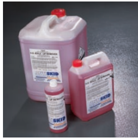
Antiskid H.D. Build-Up Remover - heavy duty sanitising oil and grease remover