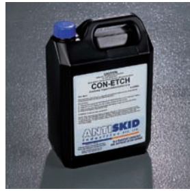
Antiskid Conetch - slip resistant floor treatment for concrete and stone surfaces